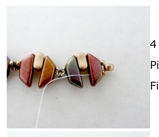
Pick up at the end 1 R15, 1 M7, 1 R15 Finish in the Tinos