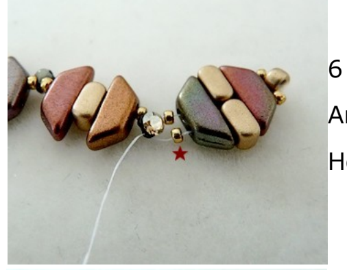
And 1 R15 i, the SM Hole at the bottom