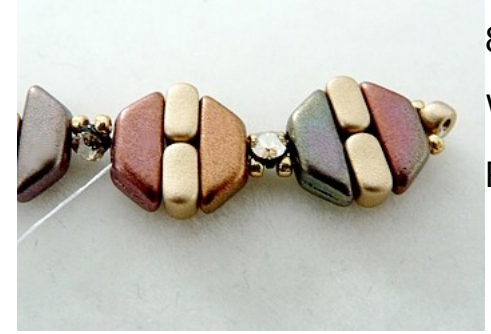
8 We have this Repeat 5, 6 and 7