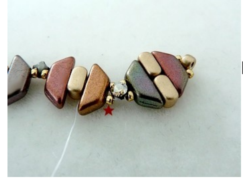
7 Pick up 1 R15 in theTinos