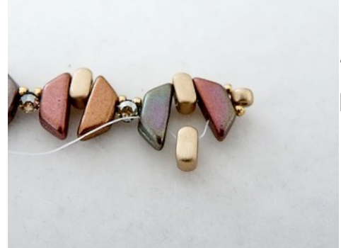
5 Pick up 1 IOS between the Tinos